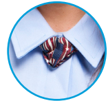
Stars and Stripes