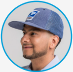
Postal Blue Baseball Cap 4