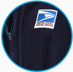
Bulky Knit Sweater