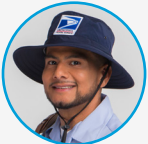
Postal Navy Blue Sun Hat