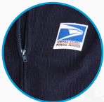
Flat Knit Sweater