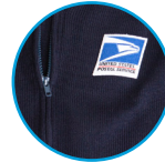
Flat Knit Sweater