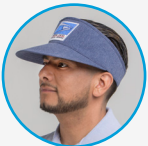
Postal Blue Sun Visor