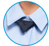
Navy Postal logo with red pin-dot