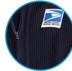
Bulky Knit Sweater