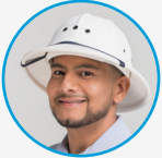
White with Blue Band Sun Helmet