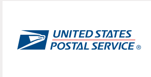
Full color corporate signature

There are logo configurations not included in these guidelines that are only used in very special circumstances. Please adhere to the following general requirements.