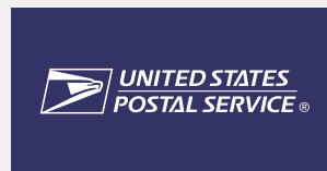
Reversed digital blue logo over #333366