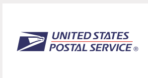
Digital blue logo (#333366)