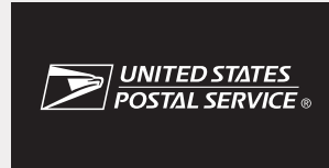
Reversed corporate signature + black