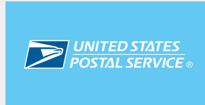
Reversed corporate signature + light blue